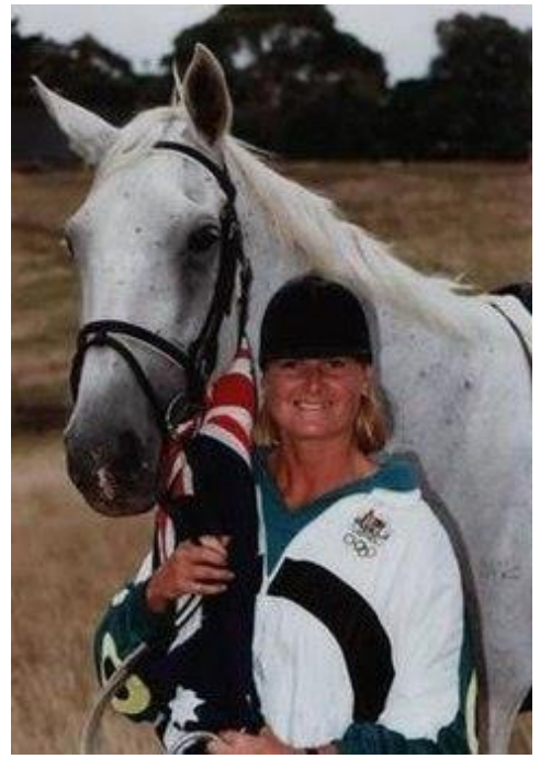
Remembering Gillian Rolton