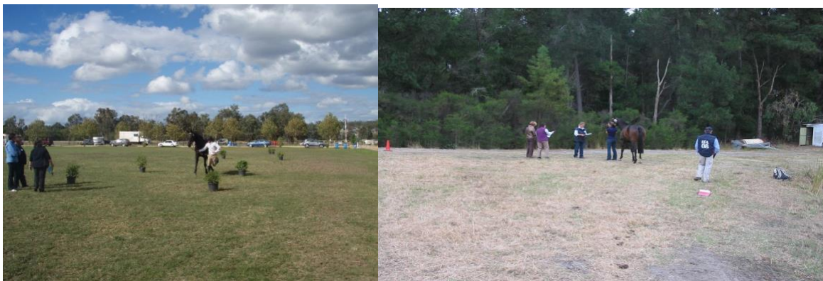
Stewarding in all weather at Adelaide 2017 from 13 – 31 degrees