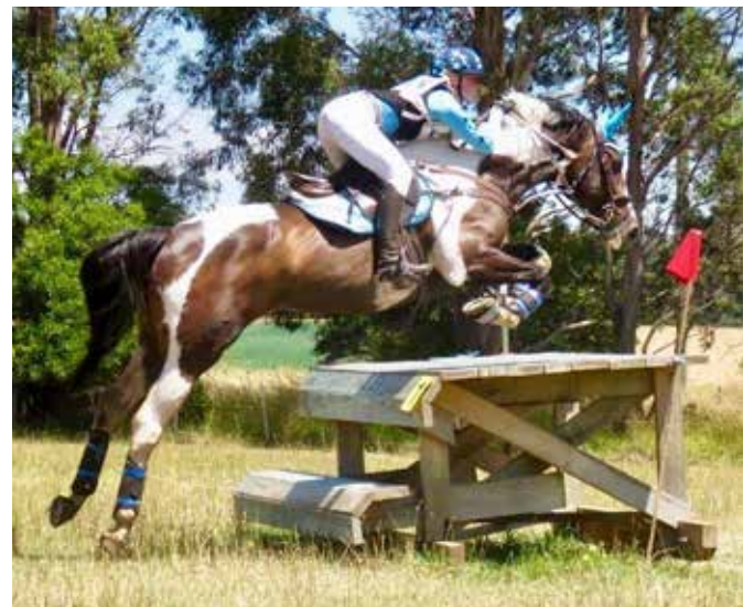
Eventing in Tasmania