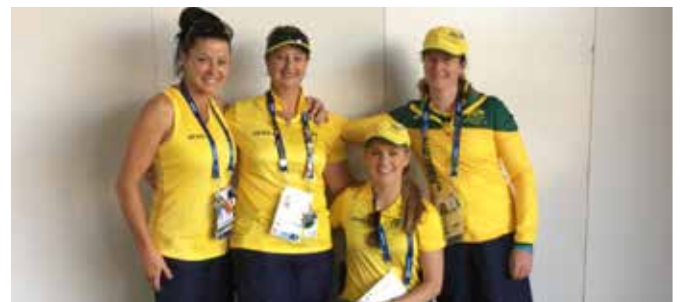
Para Equestrian: The Rio Para Team

The HP landscape in Australia is always evolving however the expectation of medal delivery remains a constant. EA is adapting to this expectation to ensure our sport retains a strong presence in the Olympic Landscape.