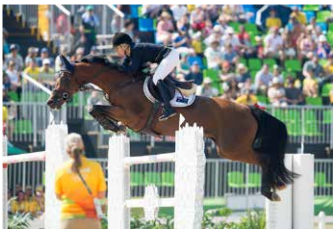
Flying high: Edwina Tops-Alexander at Rio

Although Para Equestrian and Eventing will remain the prioritised focus, HP will collaborate with the State branches, the National Discipline Committees and the National Institute Network. This will support and assist quality state based programs that are applied to the disciplines of Jumping and Dressage together with the Non-Olympic Disciplines.