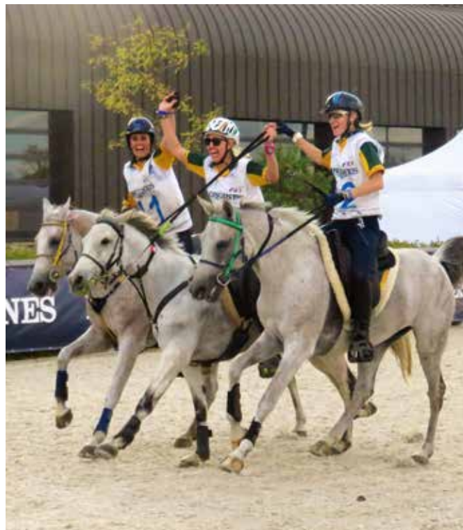
Endurance: 2016 Longines FEI World Endurance Championships team in Samorin, Slovakia

The Equestrian Australia Endurance Committee has also resurrected the Trans-Tasman competition which is a friendly international level competition with New Zealand. Our major