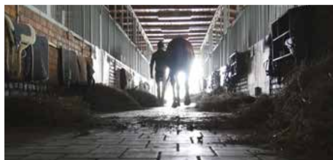
Love of the Horse