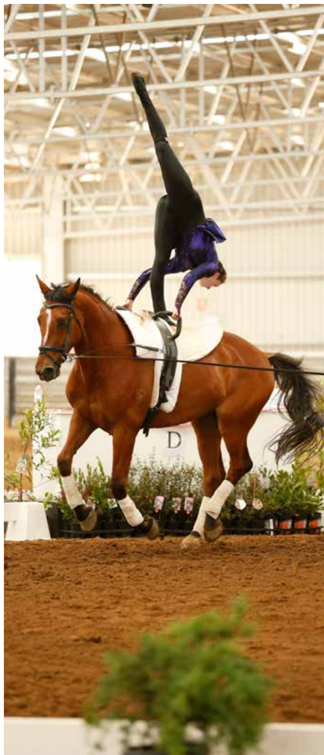
Perfect poise: Vaulting is the ultimate test of balance and flexibility on horseback