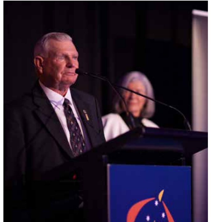
Legend: Equestrian Australia Hall of Fame Member & special guest speaker John Fahey