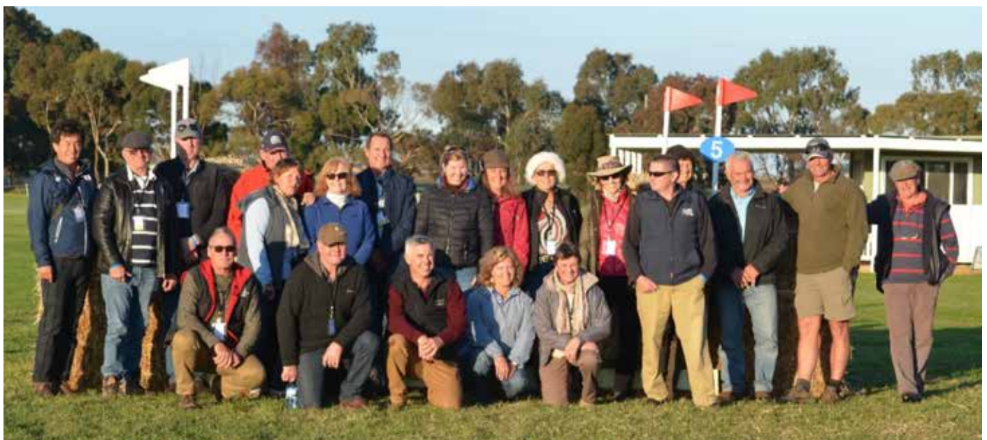
Officials course: Eventing Officials attended an FEI course at Melbourne International Three-Day Event