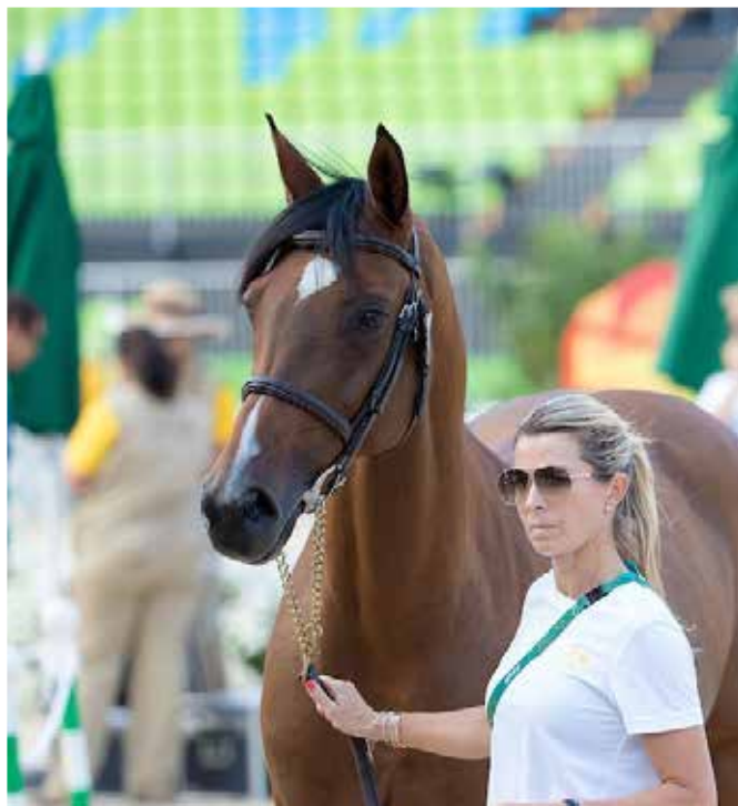
2016 Olympic Games in Rio: Edwina Tops-Alexander

The Equestrian Australia (EA) Strategic Plan 2017 – 2020, released in April 2017, shares our vision and six key priorities. Each component of our strategy is deliberately connected to emphasise the unified, consistent, measured and proactive approach required for the advancement of Equestrian sport. It highlights that one area cannot and does not operate in isolation and we need to work collectively to achieve success.