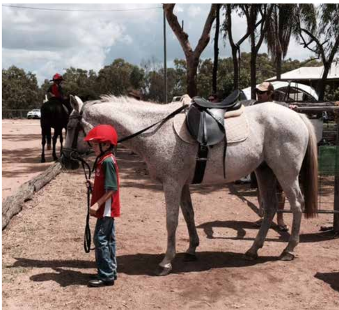
First ride: A Milman State School student enjoys his first horse riding experience

Coaches for the program are sourced locally and if necessary can be available to continue a student's Equestrian journey with established quality controlled programs and discovery pathways beyond the school yard.