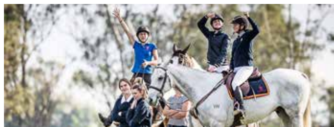
Team Spirit: Interschools competitors

Equestrian NSW staged the Sydney International Horse Trials, the Australian Dressage Championships and the NSW and Australian Interschool Championships. A massive thank you is due to the riders, the Organising Committees and the army of volunteers who made these events such a success.